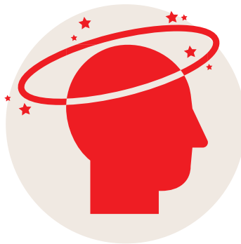
EXTREME DROWSINESS OR UNRESPONSIVENESS