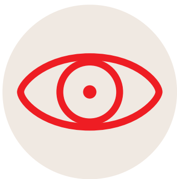
SMALL OR PINPOINT PUPILS