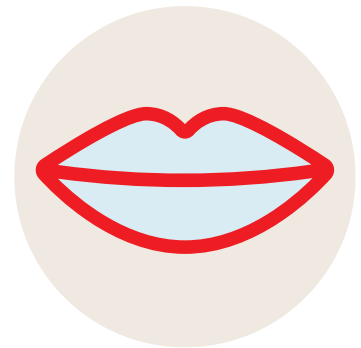
PALE OR BLUE/GREY SKIN OR LIPS