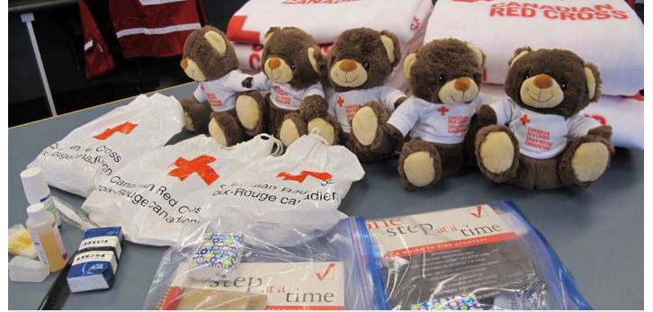
Canadian Red Cross fire recovery supplies

Beyond emergency responses, the Mobile Food Bank continues to be an essential service for many people in the Greater Toronto Area who, because of a temporary or