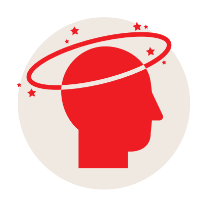
EXTREME DROWSINESS OR UNRESPONSIVENESS