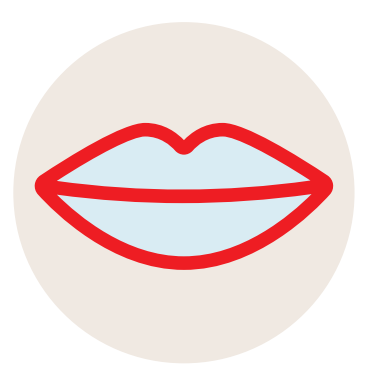
PALE OR BLUE/GREY SKIN OR LIPS