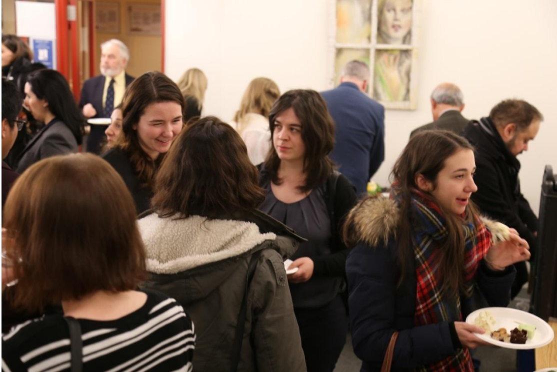
Informal reception guests