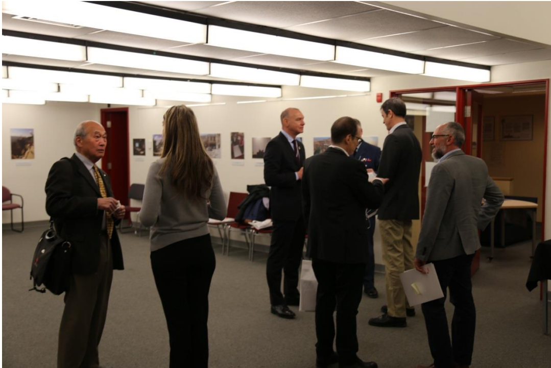
Pre-Conference meeting with Speakers and members of the Organizing Committee