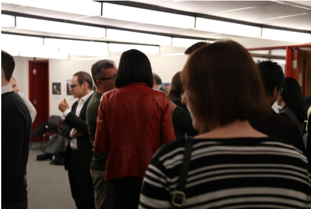
Informal reception guests