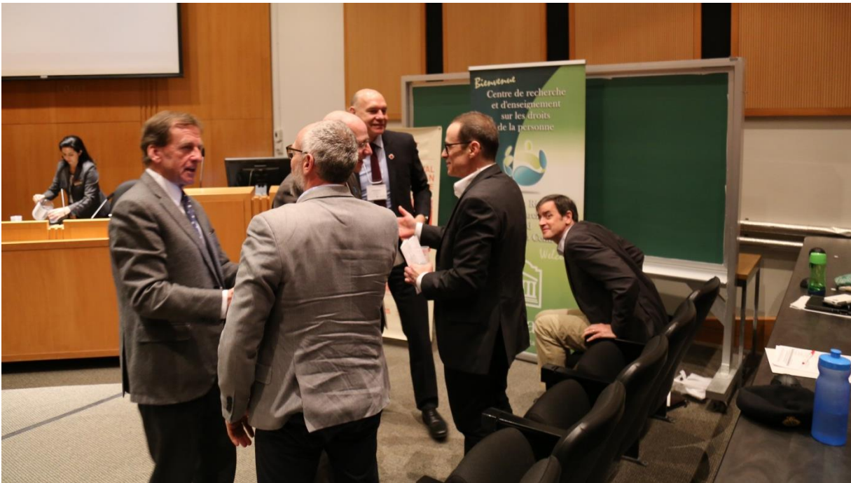
Allan Rock, former President of the University of Ottawa and Canadian UN Ambassador speaking with the conference speakers at the break