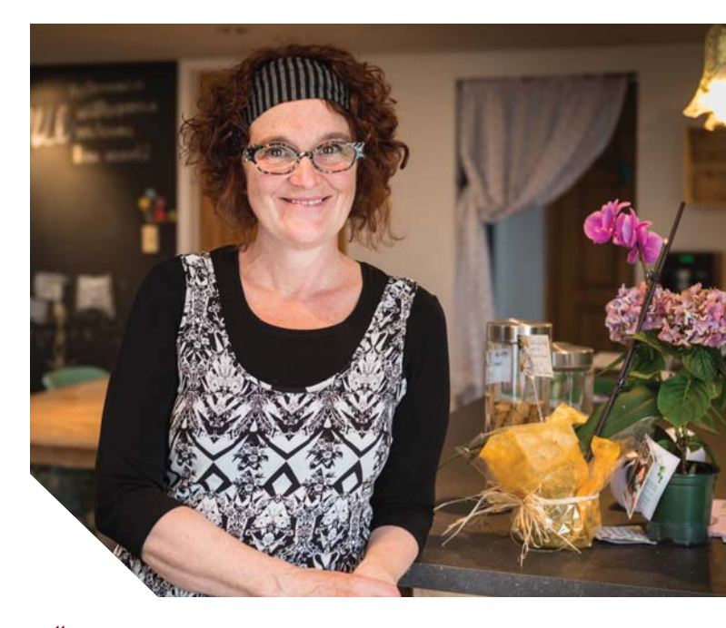
"We have to keep going, look to the future and remain infinitely patient. Our only ally is time."

"I feel very positive about the future of my business. The facade will be fixed in June, and the accommodation will open in July. I find the project extremely motivating, and I am quite proud of it. Despite the business climate in the town, which remains fragile, it is important for me to stay here and soldier on. Lac-Mégantic needs people to get back on its feet. There is no way we can forget what happened, nor should we. We have to keep going, look to the future and remain infinitely patient. Our only ally is time."