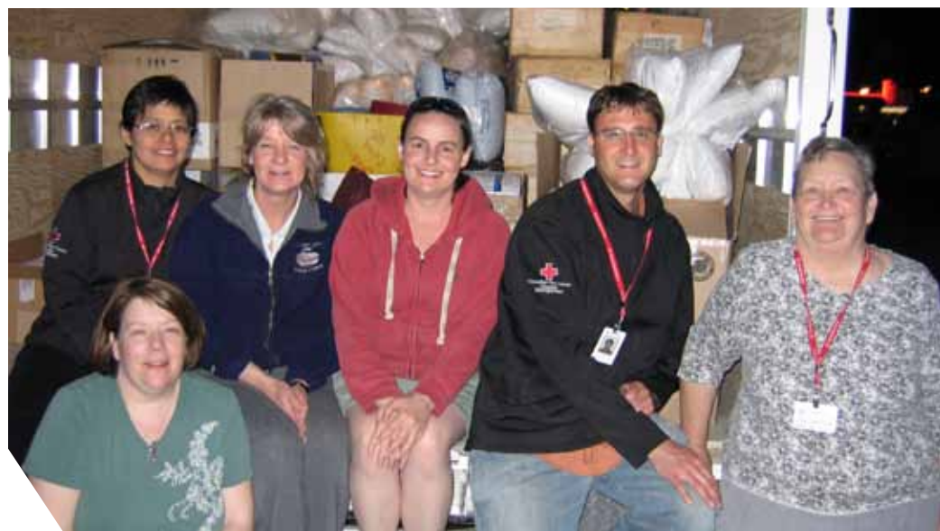
Red Cross volunteers in Grande Prairie pose after assisting in preparing and transporting resources to High Prairie.

In 2008, Red Cross was approached by a woman in search of her three younger siblings. They were separated while trying to escape Ethiopia. Just this year, we received news that one of her brothers was alive and well in Nairobi. They are now in the process of reuniting and have hope they will find their remaining two siblings.