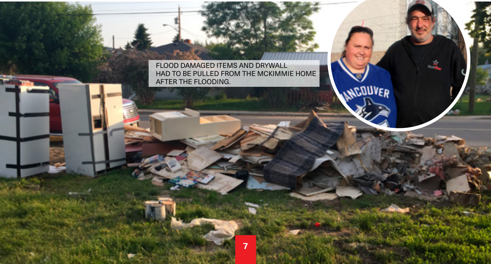
FLOOD DAMAGED ITEMS AND DRYWALL HAD TO BE PULLED FROM THE MCKIMMIE HOME AFTER THE FLOODING.

“We thought about going back to Langley, but after what this community’s just done for us, we can’t leave this community.”